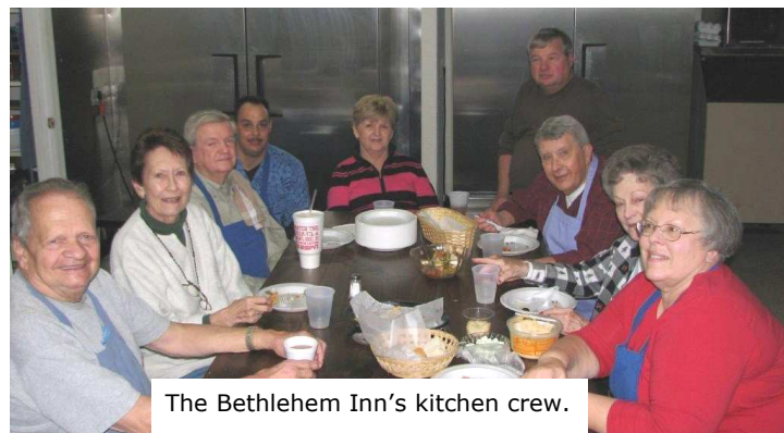
The Bethlehem Inn's kitchen crew.