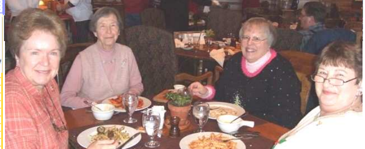
The Women's Bible Study ladies enjoyed a wonderful Christmas Lunch at Brasstown Resort. The fellowship was wonderful and the food delicious. Above are some photos from the event.