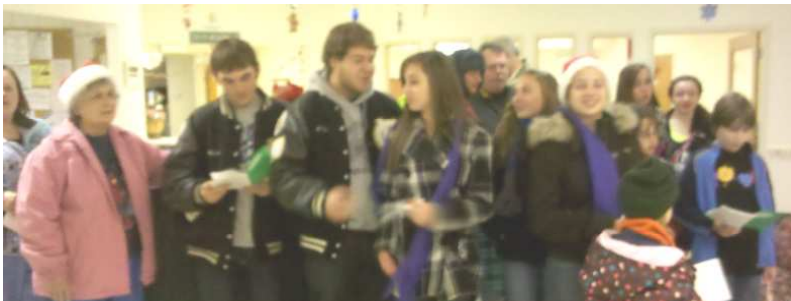
FPC youth and adults caroling at nursing home.