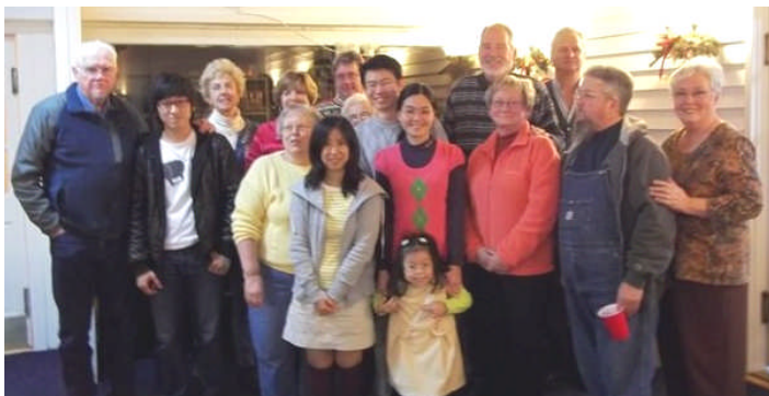
A group poses at the CIH Dinner on December 29th.

Last year, FPC collected $443 and 350 pounds of food in its Souper Bowl efforts.